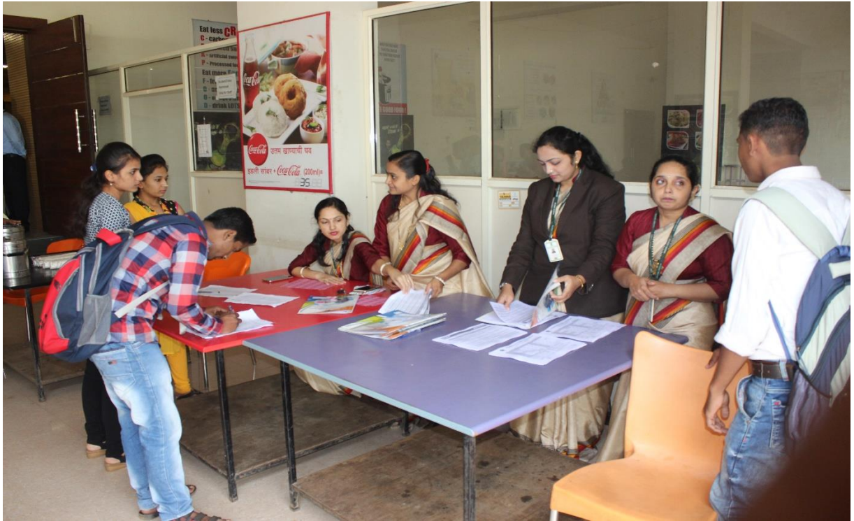
Registration and reporting of students for Induction program on day-1