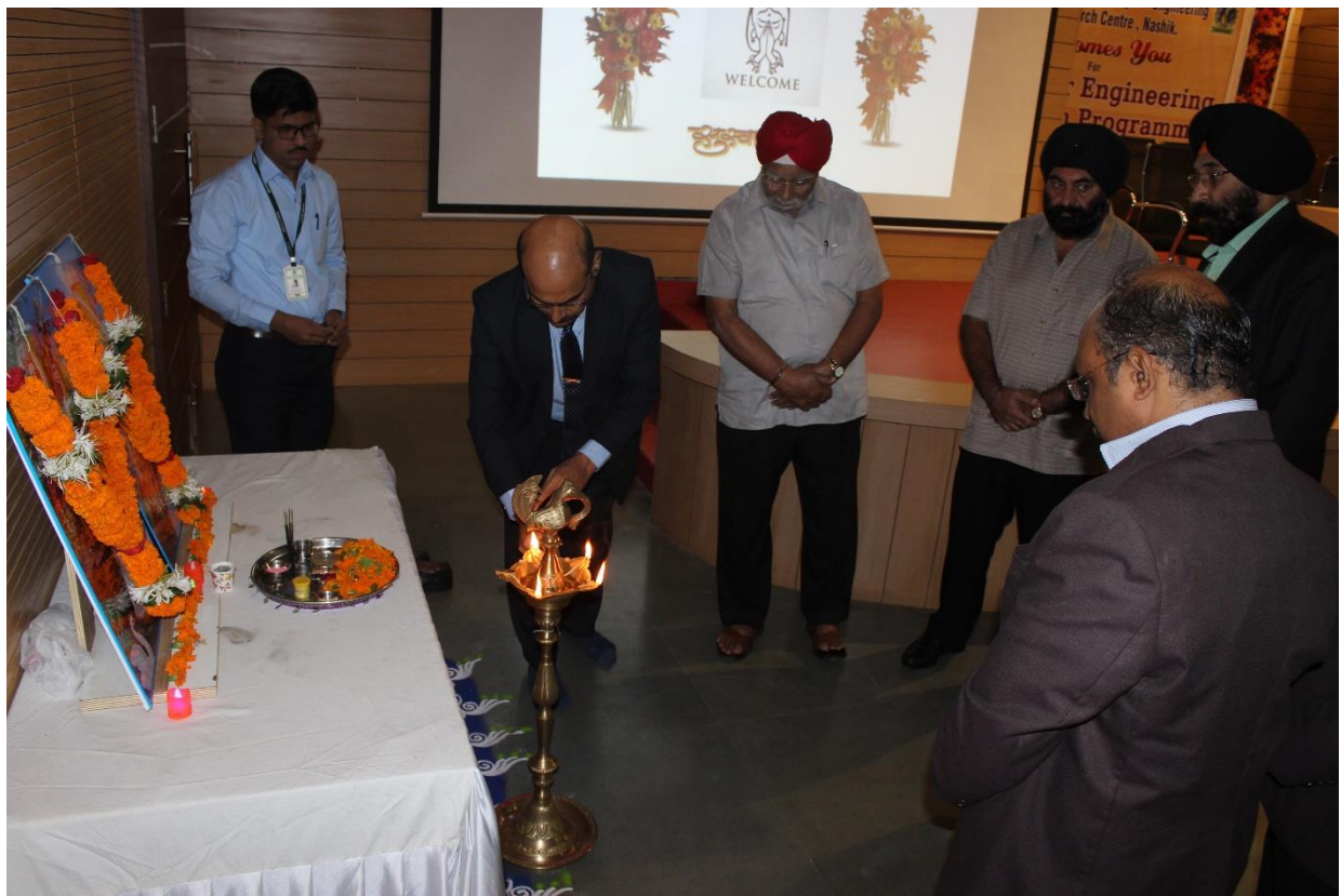
Inauguration of Induction program