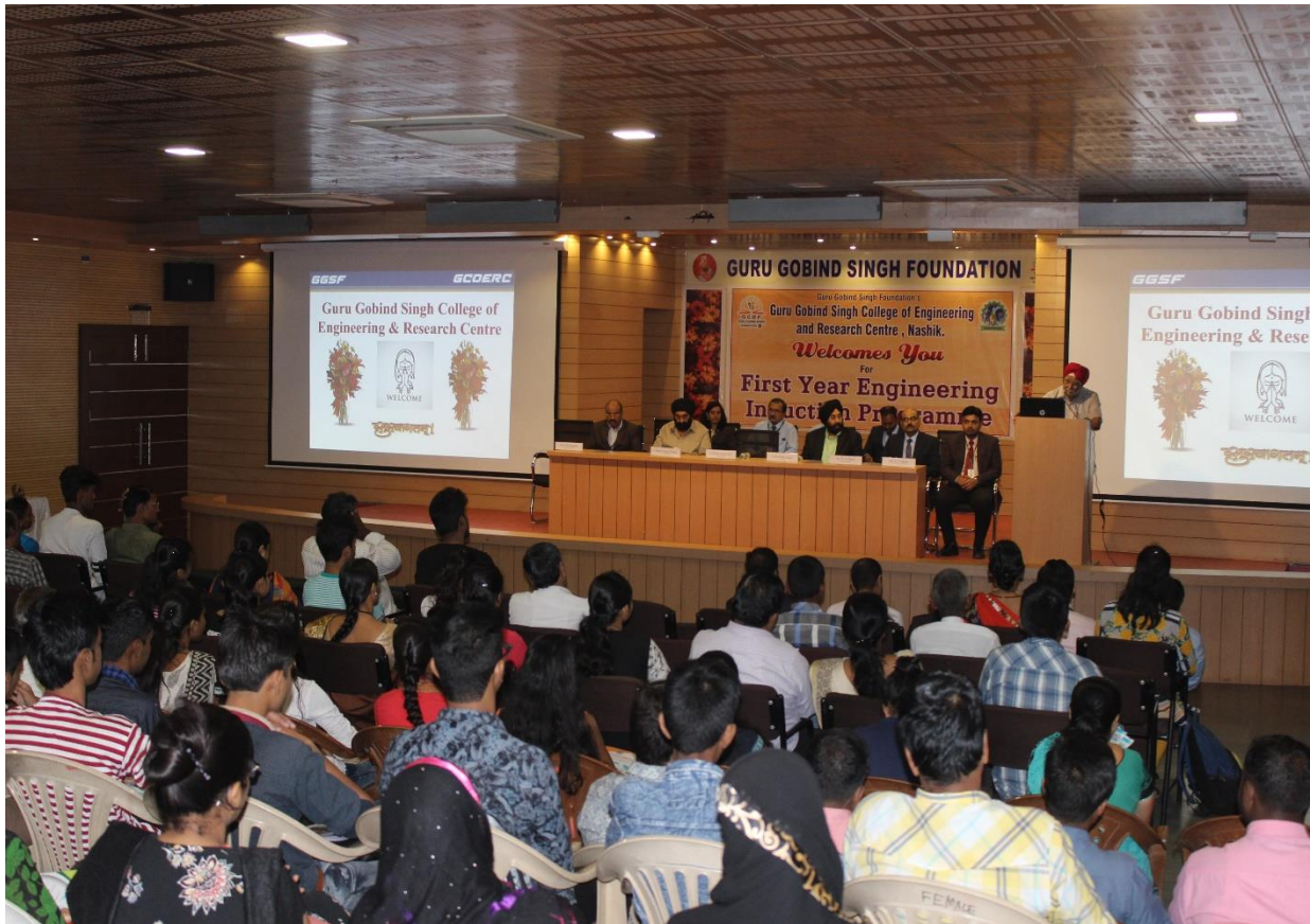
Honourable President of GGSF addressing parents and students.